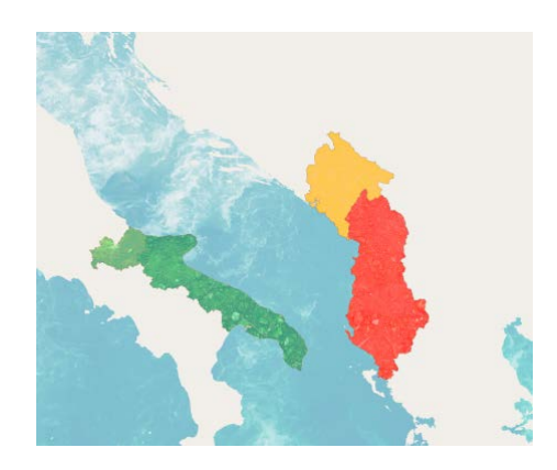
Cross border cooperation Italy-Albania-Montenegro